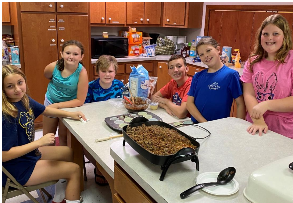
Crafting and Cooking Camp at East Kishacoquillas July 8 – 12